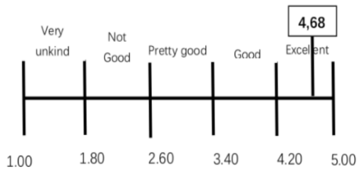
Figure 1 Continuum Line Internal Audit Variable Assessment Categorization

The results of the recapitulation of respondents' responses showed 58.8% of respondents expressed strongly agree, 34.9% agreed, 4.4% agreed enough, 1.3% disagreed, and 0.2% strongly disagreed. So it was concluded that respondents' responses about fraud prevention were said to be very good with an average score of 4.51% which was at intervals of 4.21 - 5.00. (See figure 4.2).