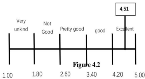
Figure 2 Continuum Line Categorization of Fraud Prevention Variable Assessment

The results of the recapitulation of respondents' responses showed 58.8% of respondents expressed strongly agree, 34.9% agreed, 4.4% agreed enough, 1.3% disagreed, and 0.2% strongly disagreed. So it was concluded that respondents' responses about fraud prevention were said to be very good with an average score of 4.51% which was at intervals of 4.21 - 5.00. (See figure 4.2).