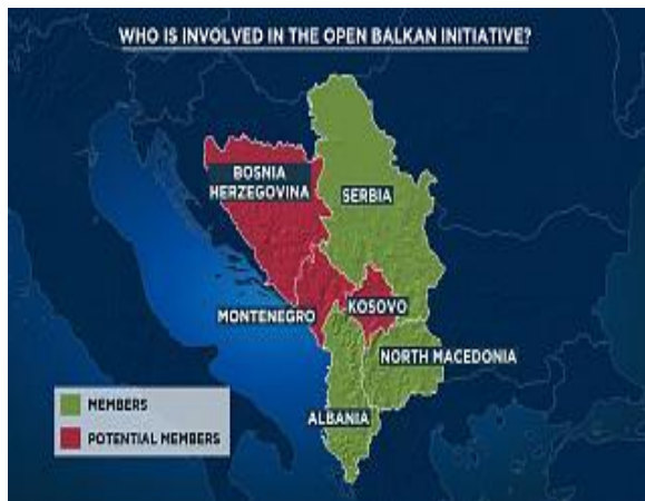
Figure 4. The green countries (members in Open Balkans). Euronews, August 31st, 2021.

km 2 and is home to about 12 million people. Albanian, Macedonian, and Serbian are the official languages. The cities of Belgrade, Skopje, and Tirana serve as administrative centers. All three member governments hope to promote commerce and cooperation as well as improve bilateral relations by establishing the zone. According to the ETIAS (European Travel and Information and Authorisation), this new agreement will allow Serbian and Albanian individuals to freely travel between the two countries without the requirement to display a passport at border control checkpoints; instead, they will be able to present a national ID card. Serbia, Northern Macedonia, Kosovo, Albania, and Bosnia and Herzegovina and Herzegovina have all endorsed the Mini-Schengen action plan for freedom of movement and a shared regional market, with Montenegro remaining the lone holdout (ETIAS).