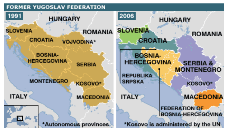
Figure 3. The breakup of Yugoslavia. BBC, May 22nd, 2006.

of their equity in most communally owned enterprises (Jones et al, 149). As a result, despite the existence of a peace deal, or the outline of one, the wars are far from done, and most, if not all, political concerns remain unresolved. Croatia, like other Western Balkan countries in transition, stepped into a long process, from the end of the war in Croatia until 2012 to join the European Union. Viducic says that Croatia has shown good price stabilization achievements, but it has struggled in the economic policy part of the transition, which could be dubbed "from import substitution to export extension." The foreign account balance is deteriorating as a result of the speed and method with which privatization and stabilization measures have been implemented, as well as the complexity of and commitment to structural adjustment programs, as well as the success of market infrastructure development and the demand for radical financial and corporate sector reforms (Viducic, 50). Furthermore, the author mentions that the presence of foreign banks in the region has boosted the region's banking markets' competitiveness. However, due to local restrictions on foreign ownership and cautious foreign participation (low capital inflows and a preference for low-risk activities), their impact is still limited. As a result, the financial markets in the region are still under-banked (Viducic, 54).