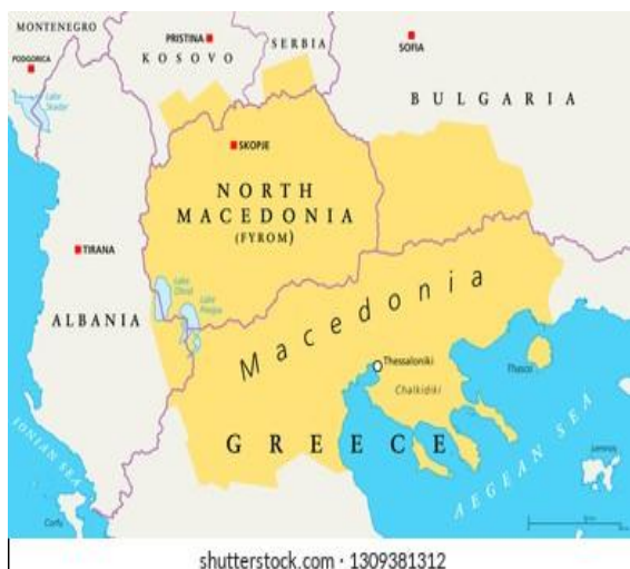
Figure 1. North Macedonia and the region of Macedonia. Shutterstock, 2010

Firstly, the European Union had a huge interest in the integration of the region in the European Union, since the acceptance of Greece in the foundation in 1981. Beata Huszka, the author of "The Power of Perspective: Why EU membership still matters in the Western Balkans" says that after 20 years of the accession of Greece in the European Union, Brussels offered for the first time to Western Balkan states the chance to join at the 2001 Thessaloniki summit (Huszka, 3). The author says that the European Union has played a clear catalyzing role in resolving ethnic conflicts and bilateral challenges in the region. Some brief case studies that illuminate the situation were focused on the European Union's relationship with North Macedonia. The relationships were especially instructive about how the integration process can improve stability, and how strongly EU integration can strengthen security in the region.