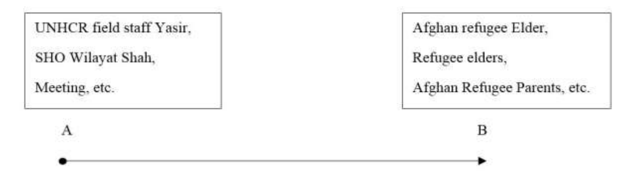
Figure 3: Diagrammatic Notation of PATH Schema in Taglines

mentioned above, all typologies of SPACE Schema will have figure, ground and plane (see above), likewise, the PATH Schema contains a source (starting point), a goal (ending point) and a sequence of motion that enables the peripatetic figure to move in a particularly specified direction, i.e. "connecting source with the goal" (p. 113). Johnson (1987) explained that PATH schemas give rise to metaphoric structures such as PURPOSES ARE PHYSICAL GOALS. This implies, that physical realisations are mapped onto abstract domains and thus such mapping can be seen both at concrete and abstract levels in the Afghan refugee photographs and taglines respectively (see diagrammatic notation in figure 3, below).