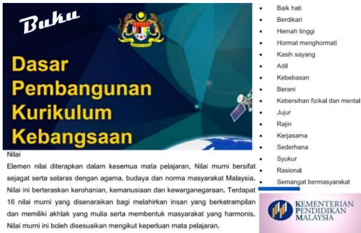
Figure 3. The noble values contained in National Curriculum Development Policy based on the Philosophy of National Education (FPK)

In addition, there are other factors that complicate the process of inculcating good values among teachers to students in these KBD schools. Among them are teachers who are less exposed to training, teachers find it difficult to get suitable BBM teaching aids, less use of ICT and multimedia, unable to use the Arabic medium well and teaching methods that are more focused on translation methods. The following is a further discussion of the findings from the researchers on the problems of teachers mentioned. Some consider teachers who teach Sekolah Menengah Agama Rakyat, state Religious Secondary Schools and Sekolah Menengah Agama Swasta as untrained teachers Muhammad Haron Husaini et al. (2018) This is because most of them are not given the opportunity to undergo proper training from KPM.