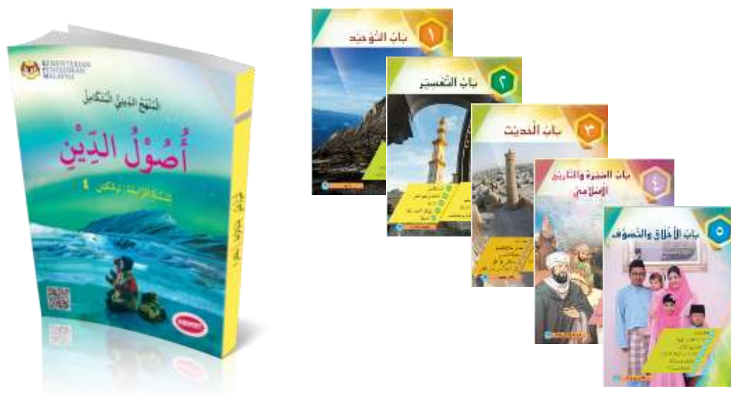
Figure 1. Form four Usuluddin textbook and its chapters

implementation period of this KBD has started from the first year of its official implementation in 2015 until today (Bahagian Pendidikan Islam, 2015b, 2015a). Figure 1 below is an example of form four Usuluddin textbook and its chapters: