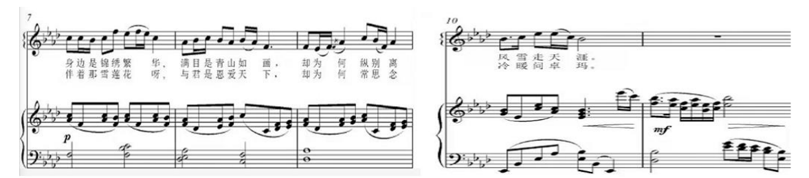
Figure 3. Score 3 "Princess Wencheng". Lyrics by Zhang Minghe Yin Qing Qu "Princess Wencheng", bars 7~10 Excerpt 2010.

From a narratological perspective, there different classifications of narrative perspective within a story text (Tan et al. 2021). The French scholar Genette in Narrative Discourse has simplified and generalised his taxonomy into a trichotomy, using the term 'focalization' (Van Leuven-Zwart 1989) to explain this classification (Fang 2019). (1) The narrator says more than the other characters i.e. 'unfocused', narrator > characters, (2) The narrator can present only what a character knows. That is, "internally focused" narrator = character, (3) The narrator is presented with less information than the characters know, that is, the narrator is 'externally focused' < character. Dutch narratology Mick Barr likewise refers to focus. She suggests that in situations where there is a focus, three questions are crucial. (1) What does the character focus on and what is it aiming at? (2). How does it engage with this: with what attitude does it observe things? (3) Who focuses on it: who is it focusing on? Many of us struggle to distinguish between these three questions when analysing sentences specifically, thus creating a subjective bias in our understanding of the narrative text.