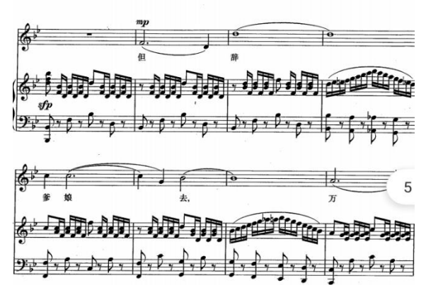
Figure 1. "Mulan enlisted" example 1. Lyrics by Liu Lin, Song by Wang Zhixin. Score example excerpt from Chen, Junhua. 2002. Selected Vocal Works by Liu Lin and Wang Zhixin. Shenzhen: China Drama Publishing House.

The classic passage in this piece, bars 50-60 of "Mulan enlisted", embodies the "YaoBan" vocal style of traditional Chinese opera, which is presented in such a way that the accompaniment music is separated from the singing, with the accompaniment music following the normal eye rhythm while the singing rhythm is slow, commonly known as "tightly shaken and slowly sung". The singing style is able to express emotions such as tension, excitement, joy or grief. In the example clip, in the main melody, the singer is required to sing at a medium-slow, medium-weak tempo in the middle and high register, reflecting the 'subjective image' represented by the heroine 'Mulan', expressing her uncompromising filial piety towards her parents, her loyalty to her father, to her country and to the king, and her firm will for the unknown future. The song is an expression of the complex psychological state of the female protagonist, Mulan, who expresses her uncompromising filial piety towards her parents, her firm will to serve her father, her loyalty to her country and her king, and her confusion and uncertainty about her future. In the accompanying melody, the composer uses four consecutive fast and dense sixteenth notes per measure as the main rhythmic pattern, creating a blend of slow singing and fast