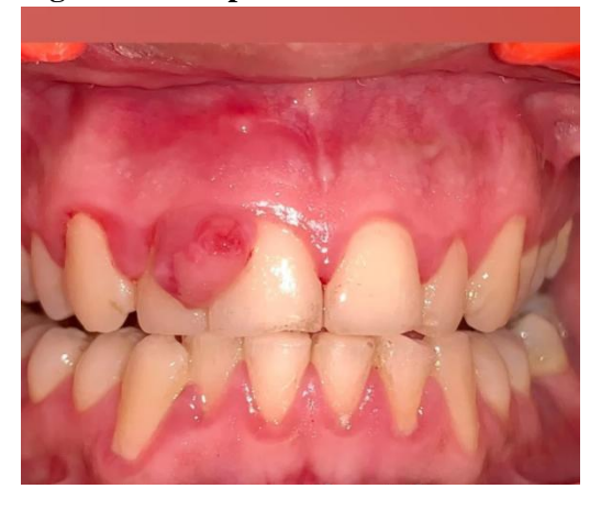
Figure 2 Excision using electrosurgery