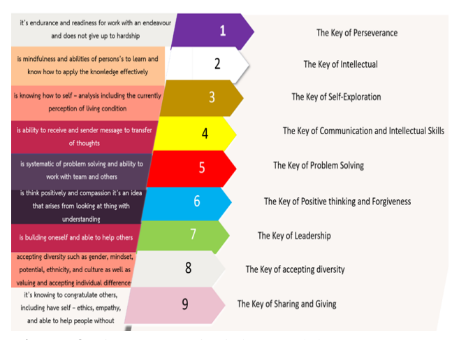
Figure 3 Nine Keys Principles Model

Another dimensions that can build innovation leadership relates to nine key philosophy for example the key of leadership refer to leader should have the ability to enable people or team to achieve their goal. Including the ability to come up with new idea by applying knowledge and creatively it's a characteristic of innovation leadership with a growth mindset. It's an attempt to lead oneself from the fixed mindset, give chance for self and learn with diversity groups [24]. In addition, leader should add the key of accepting diversity (key 8) in the source of thinking in accepting diversity such as gender, ideas, potential, ethnicity, culture, as well as valuing and accepting individual differences. Finally, the leader should add the key of sharing and giving (key 9) to help the people without expecting anything in return. Including empathize with oneself and others. It's the ability to realize, concern people in organization and developing others [25]. As noted earlier, application of nine keys principles to build the innovation leadership to develop organization for excellence a body of knowledge can be created as follows: