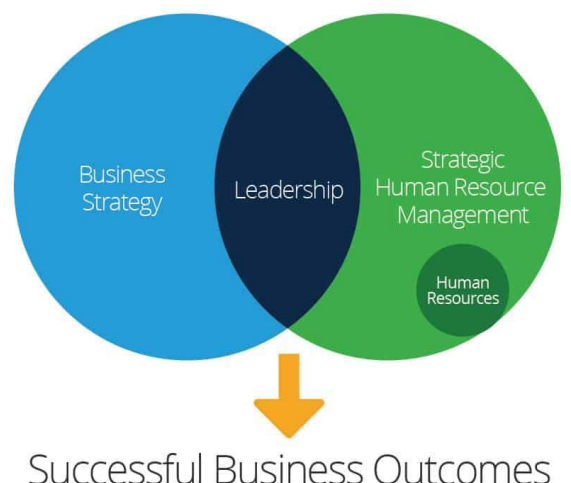
Figure 1: Strategic HRM

The review of the literature of HRM strategies strategic success resulted crystallization of the study model, which was formulated in light of the study problem and its objectives, [4], See Figure 1: